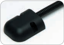
Cabling Kit for the SSS-5