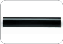
Filter Cover for SSS-5