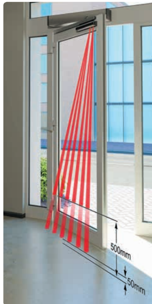
Detection Area Distance Adjustment