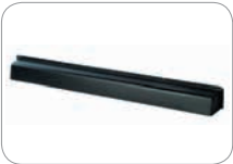
SSS-5 WC Black Weather Cover 700mm in length